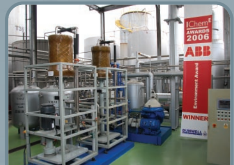
VMAT - Vibrating Membrane Used Oil Recycling System

VMAT includes Vibrating Membrane, can filter Carbon Soots & Metal Particulate in Used Oil. Intense shear waves at the membrane surface causes solids and foulants to be lifted off the membrane surface and prevents fouling.